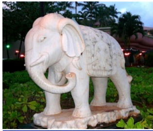
Photo Above: The "White Elephant" photo was taken by Rotarian Jack Wallace during a trip to Hawaii in 2008.